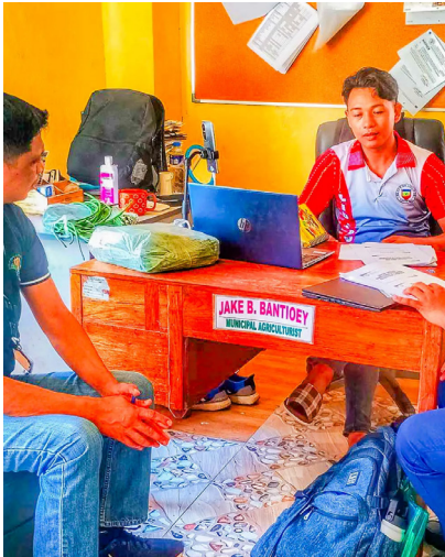
from page 28, DA-SAAD Ilocos to cover 7 more priority municipalities

Rural Appraisal (PRA) in February 2024 to ensure accurate selection of beneficiaries and strategize provisions of livelihood projects based on assessed needs of the farmers.